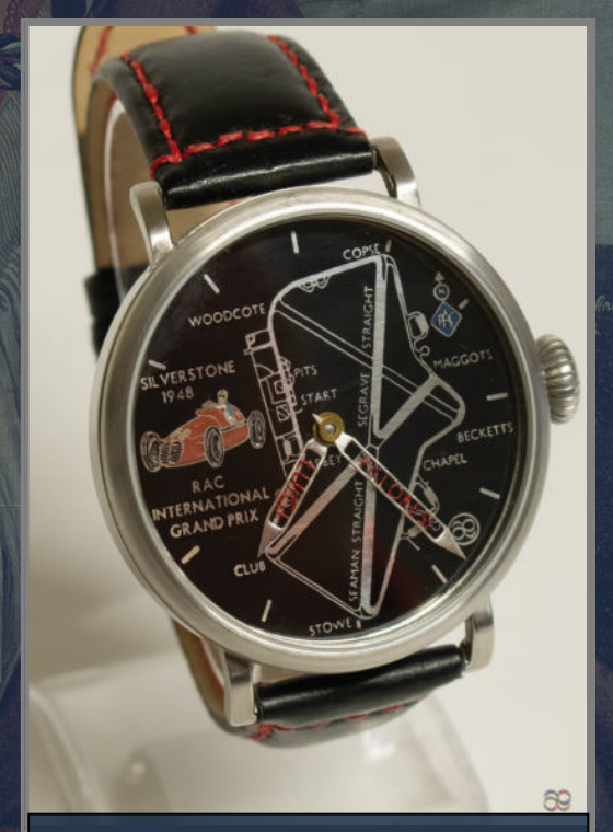
Silverstone 1948 GP. Handmade watch with etched Argentium Silver dial and hands. Urushi Lacquer infill and colour.

e-mail: alex@alexanderevans.co.uk Phone: 01844 238924 Mobile: 07930 758066