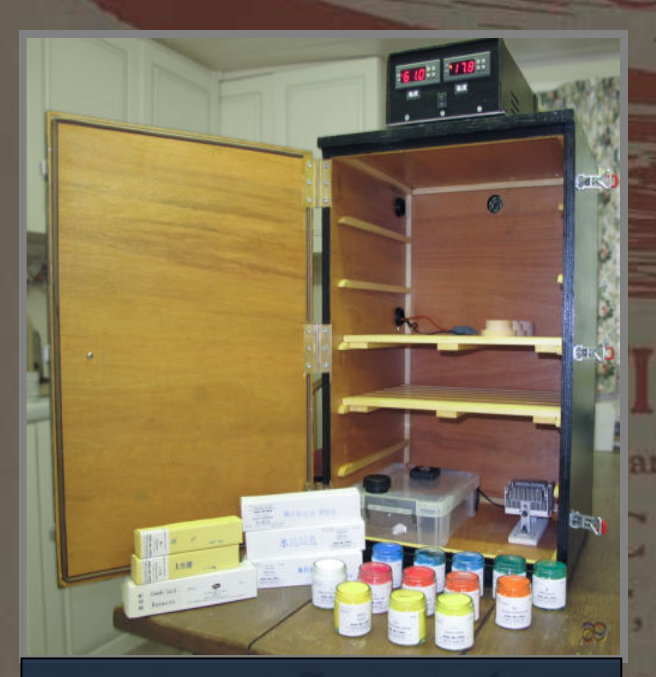
Japanese Urushi Lacquer curing cabinet. This is called a Furo in the Japanese language. Temperature and humidity required for curing changes depending on the lacquer type and pigment so a digital controller is used to set and maintain these parameters with a great deal of accuracy. (Self designed and made)