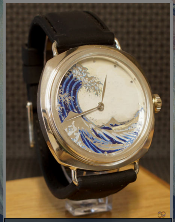
Hokusai Great Wave. Handmade watch with hallmarked solid silver case and hand etched micro detail silver dial with fine art colouring.