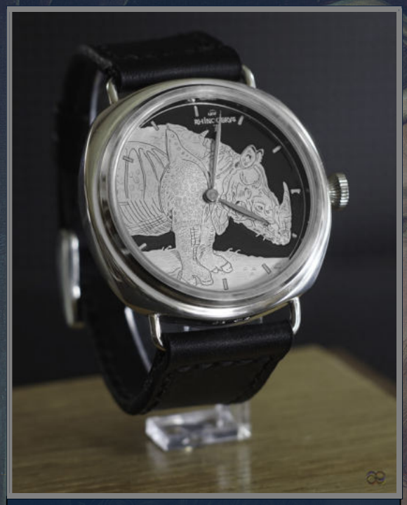
Durer's Rhinoceros. Handmade watch with hallmarked solid silver case and hand etched micro detail silver dial with Urushi lacquer inlay.