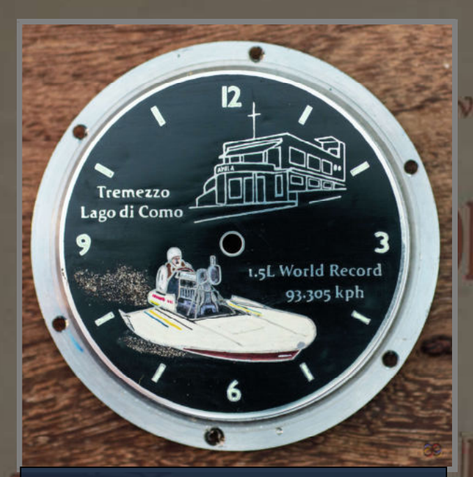
Niniette III world record hydroplane dial. Handmade etched silver dial with black Urushi lacquer background and fine art pigment colour.