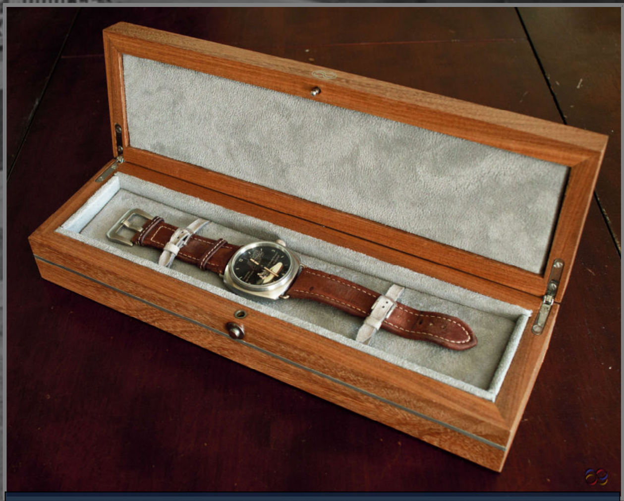
Finished watch and presentation box. Each box is handmade using materials and styling that has a an appropriate connection to the Art Watch.

Example pages from an Art Watch project book showing photographs and explanation of the crafting process. The books also include researched information about the specific project subject.