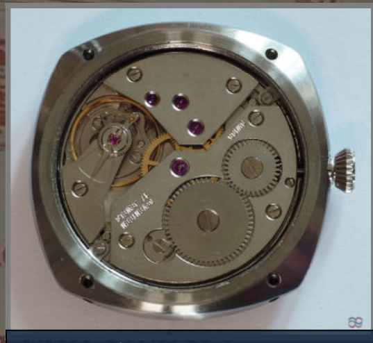
Handmade finished case with high quality Swiss ETA 6497 17 jewel mechanical movement,