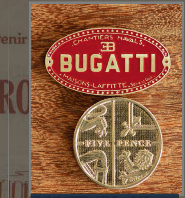
Handmade micro etched scale replica silver Bugatti Chantiers Navals badge. 25mm x 12.5mm