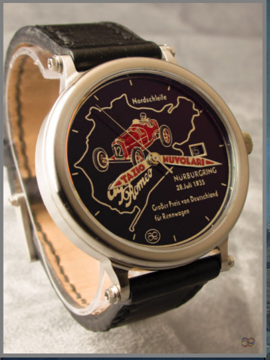
Nuvolari 1935 Nurburgring GP. Handmade watch with etched Argentium Silver dial and hands. Urushi Lacquer infill and colour artwork.